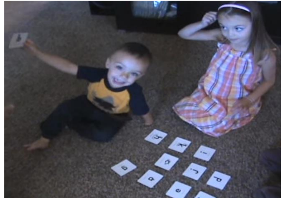
4. The younger 2-yr old finds it, and excitedly shows it to his mother.