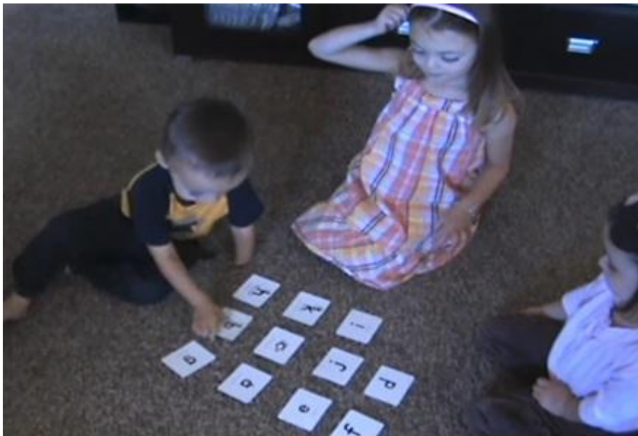
3. The 4-yr old then asks the younger 2-yr old to find letter b, bat and ball.