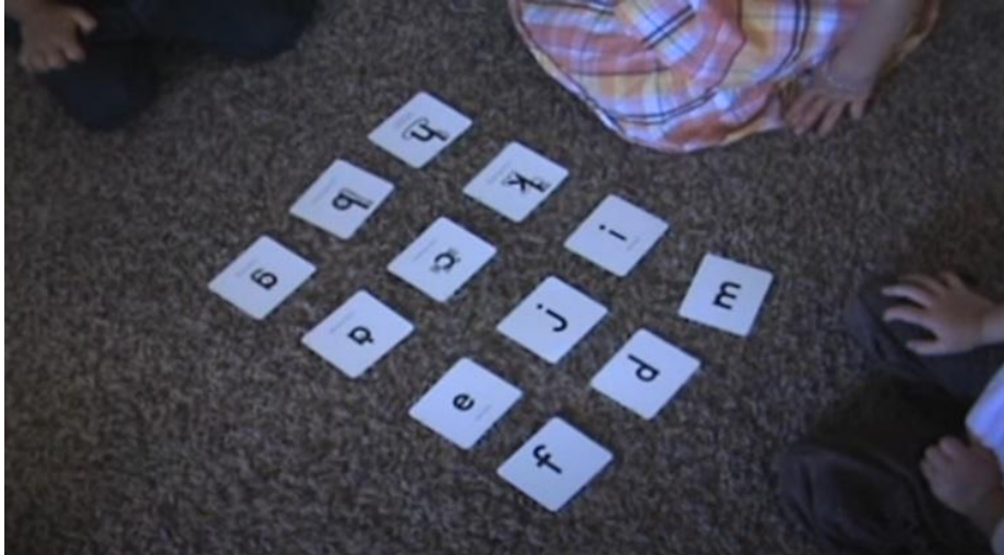
1. Lower Case cards. The 6 cards in front of the 2-yr old girl are plain letters. The 6 in front of the 2-yr old boy have the picture clue side up.

Here's a few scenes from this video. It's a bit blurry, but it is my favorite! You watch as a 4-yr old learns how to teach two 2-yr olds.